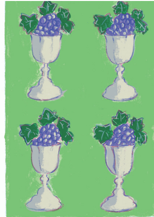
Fruit of the Vine