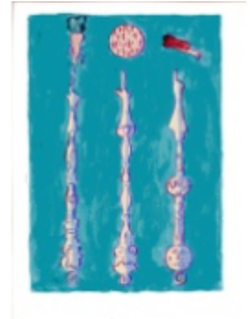
Pesach, Matzah, Maror