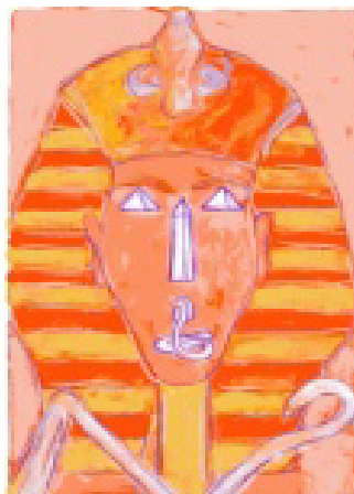
Pharaoh Who Knew Not Joseph