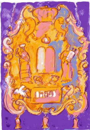
Pesach Torah Breastplate