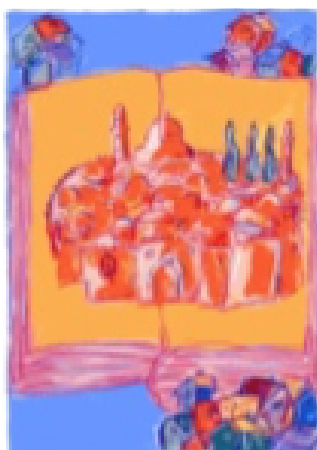
Next Year in Jerusalem